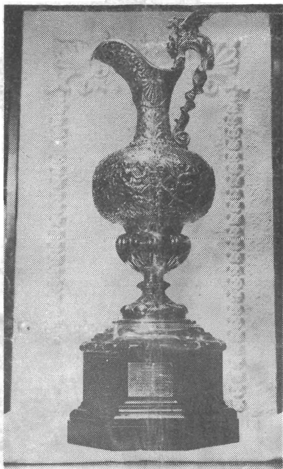
THE CALDER CLELAND MEMORIAL TROPHY